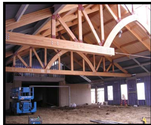
Below: Inside the worship space

Plans call for the construction to continue through the winter with the first worship services expected for late spring 2010.